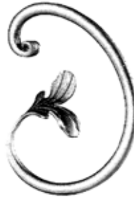
H 190 x L 125 mm A 321.703 🔥 ● 12