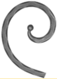
H 170 x L 115 mm