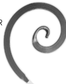
H 200 x L 135 mm