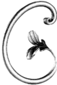
H 190 x L 125 mm A 321.702 🔥 ● 12