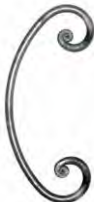
H 300 x L 140 mm