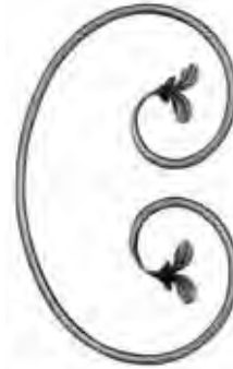
H 400 x L 270 mm A 321.704 🔥 ● 12