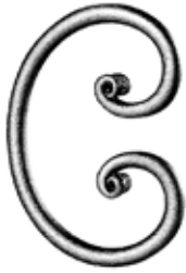
H 160 x L 110 mm A 321.701E 🔥 ● 12