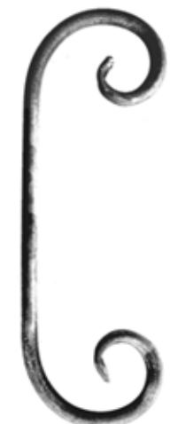
H 420 x L 140 mm