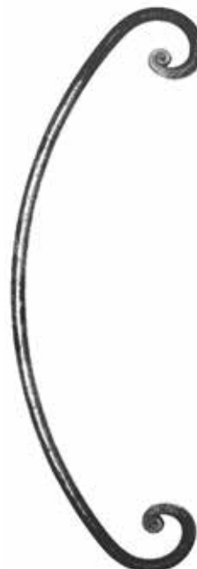
H 700 x L 220 mm