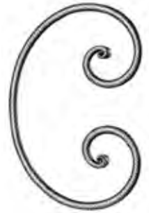
H 300 x L 200 mm A 321.705 🔥 ● 12