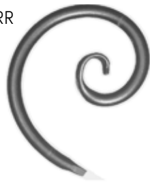
H 200 x L 135 mm