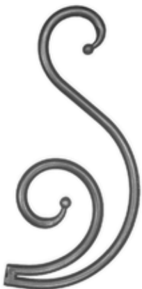
H 350 x L 150 mm