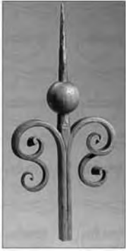
H 600 x L 260 mm