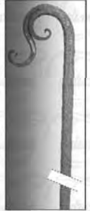
H 1000 mm